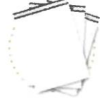
Plastic shipping envelopes