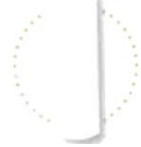
Pellet Wrap &