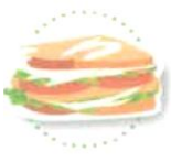
Ziploc & other reclosable