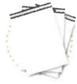
Plastic shipping envelopes