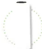
Pellet Wrap & Stretch Film